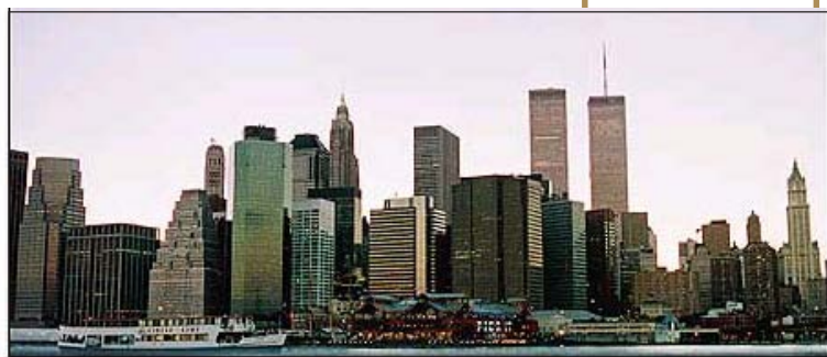
View of lower Manhattan with the World Trade Center towers (right of center), as seen from Brooklyn.

To straighten out the political and intellectual mess we face today, we must reaffirm our commitment to reason and freedom by protecting ourselves from killers, foreign and domestic, physical and intellectual.